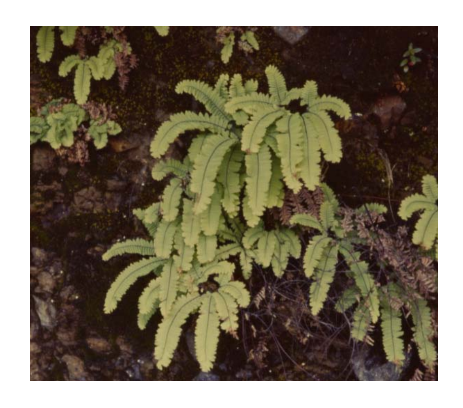
Habitat Acquisition Trust