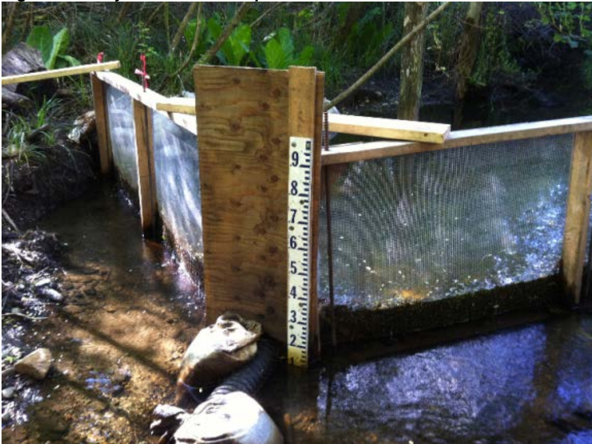
Figure 2. Shelly Creek Smolt Trap 2013

The trap box was checked daily by teams of volunteers. Daily inventory and fork lengths were recorded for coho smolts. Daily inventory was also recorded, for rainbow and cutthroat trout, sculpin and stickleback. Water level, water temperature and air temperature data was also gathered.