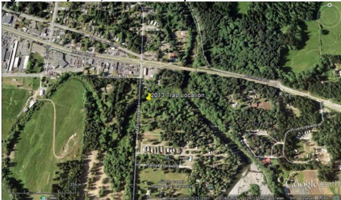
Figure 1. Shelly Creek, Parksville BC Trap Location

The smolt trap was installed approximately 200m upstream from the confluence with the Englishman River (Fig. 1). It was placed downstream of the Martindale Road culverts, which drain an upstream pond. The purpose of this location was to ascertain the anadromous use of this channel during months of high flow.