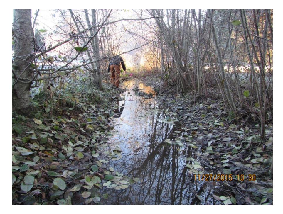
Figure 7. Riparian Conditions of Shrubs Common to Reach #4

The riparian conditions of each assessment site assessed depended on the landuse. Where the stream channel crossed through a hobby farm's open pasture, the riparian conditions were limited to a two meter fringe of alder and shrub (Fig. 7).