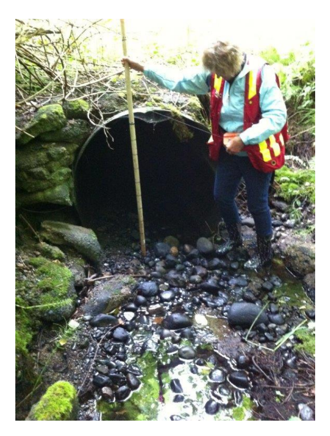
Figure 3. Measuring Cluvert at Blower Road