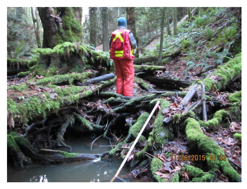
Figure 4. Example of Large Woody Debris Obstruction in Reach #3

Within the reach, there were sixteen (bankful) debris obstructions with accumulated woody debris that accumulate in jams covering thirty two percent of the reach's length (Fig. 5). Three road crossings in this reach (inculding Hwy. 19) have culverted (altered) twenty two percent of the channel's length.