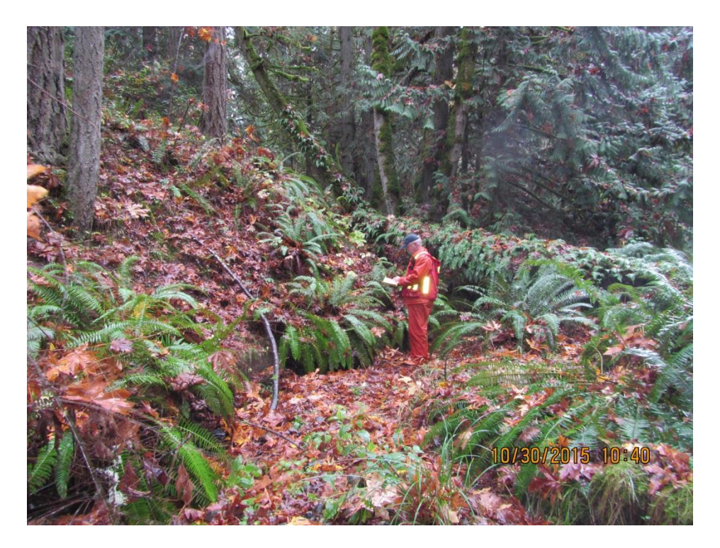
Figure 6. Conifer Forests Dominate Riparian in Reach #3

Riparian conditions through much of the reach are exellent, with maturing second growth conifer forest conditions providing stable riparian conditions (Fig. 6). Landuse is primarily forestry (Crown owned). Two hobby farms in the upper portion of the reach have resulted in enroachment of a building and (private) bridge impacting the channel.