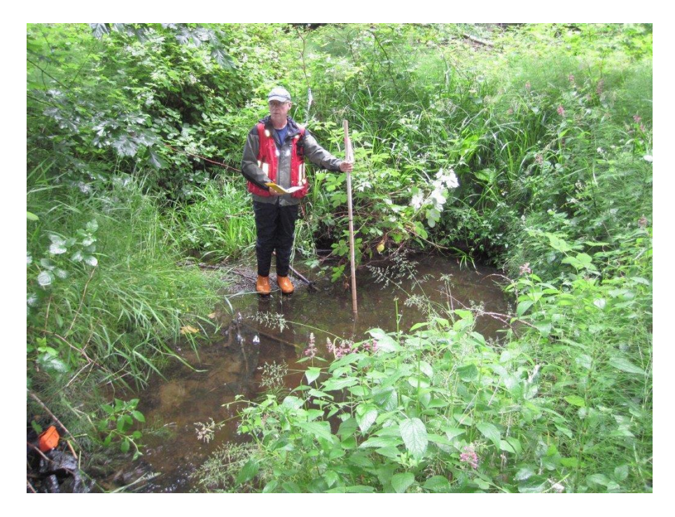
Figure 2. Measuring Pool Depth on Shelly Creek